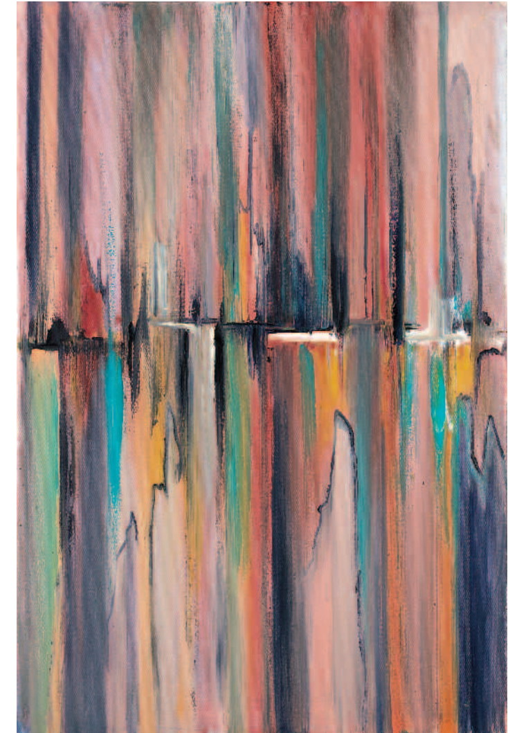
"Soundwave XII (Charleston)" 24" x 36" Oil on Canvas