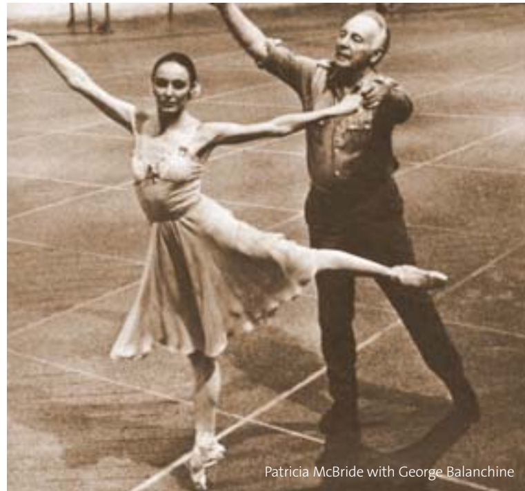
Patricia McBride with George Balanchine

We could not be more proud of Patricia McBride and thankful that she and Jean-Pierre Bonnefoux bring the highest standards of excellence to Charlotte Ballet and to our city.