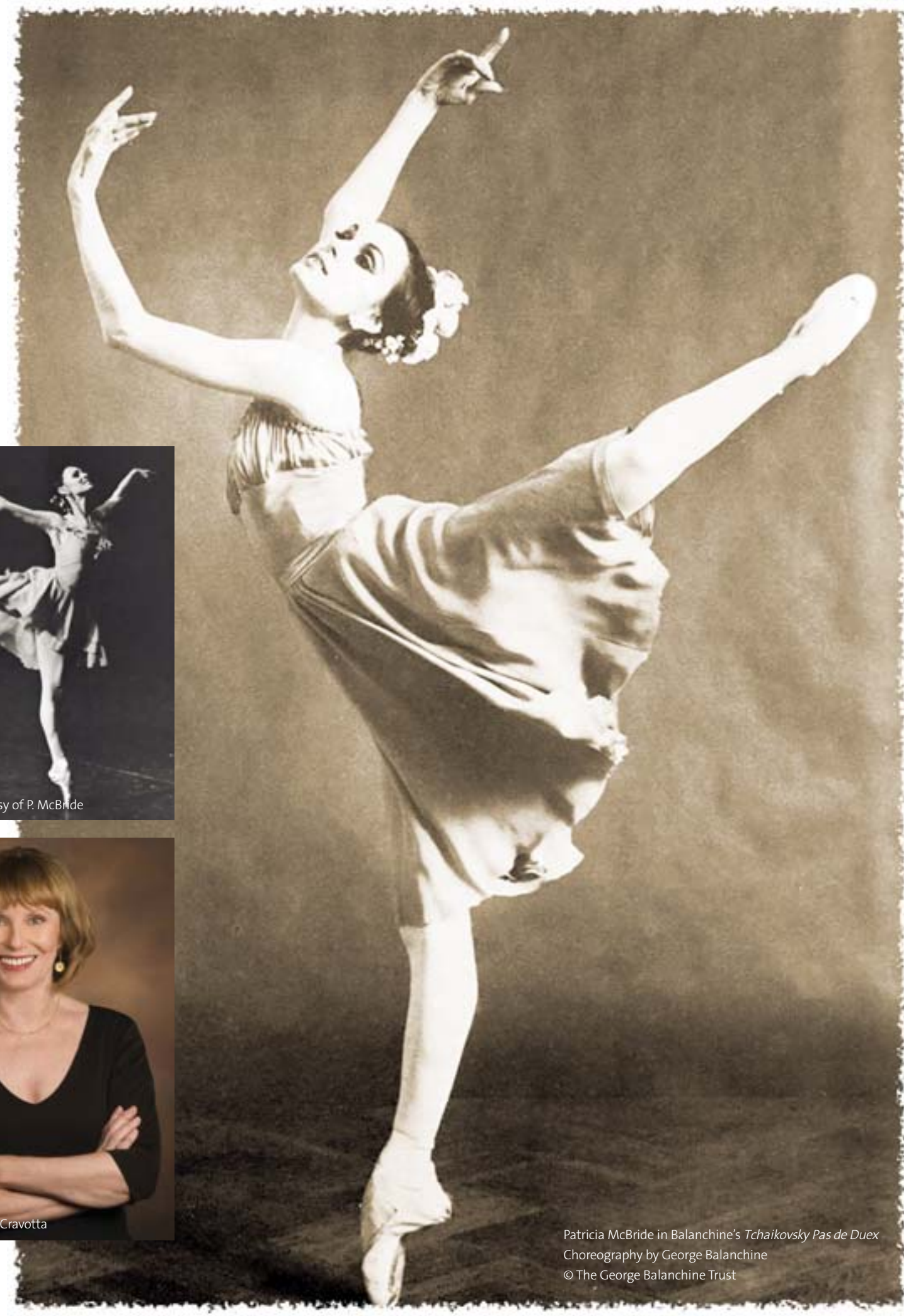
Patricia McBride in Balanchine's Tchaikovsky Pas de Deux Choreography by George Balanchine