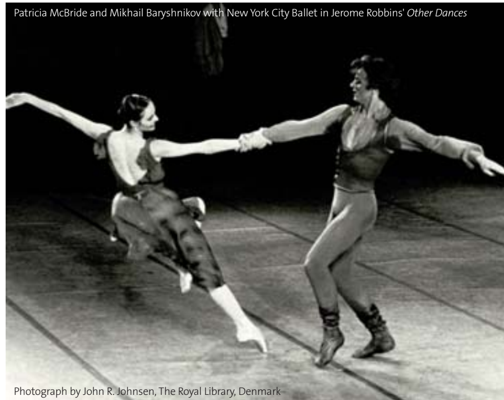
Patricia McBride and Mikhail Baryshnikov with New York City Ballet in Jerome Robbins' Other Dances